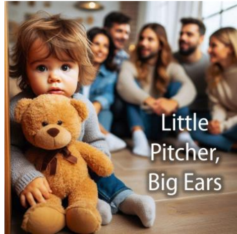
Little Pitcher, Big Ears