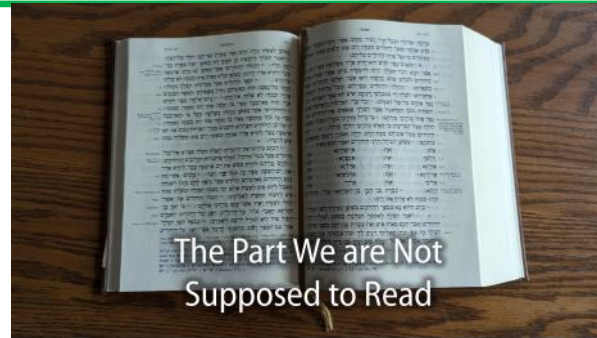
The Part We are Not Supposed to Read